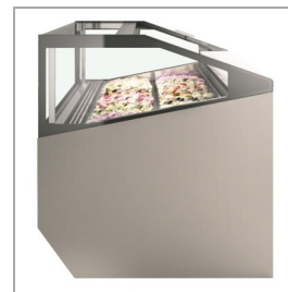
Glass end walls as standard